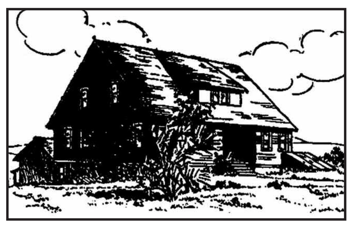
THE ADMINISTRATION BUILDING

This building contains the General offices, the Printing plant and the Mailing Department.