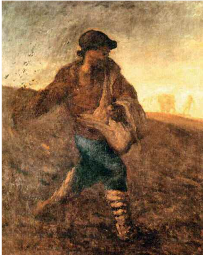
Oil on canvas, Jean-Francois Millet (1814-1875)

Christian teachings prior to the fifth century