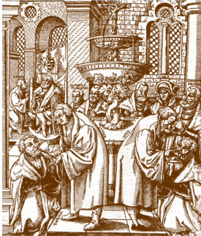
Woodcut (c. 1550) from Lucas Cranach the Elder's workshop, Wittenberg, Germany

In 382 A.D. a scholar we know as Jerome was commissioned by Pope Damasus to revise the Latin version of the Bible, which we know as the Vulgate. 3 The apocryphal books were a part of it. For more than a millennium it was indisputably the Bible of the Church. When Wyclif and Purvey prepared the very first English translation of the Bible, 1382-1388, the apocryphal writings were