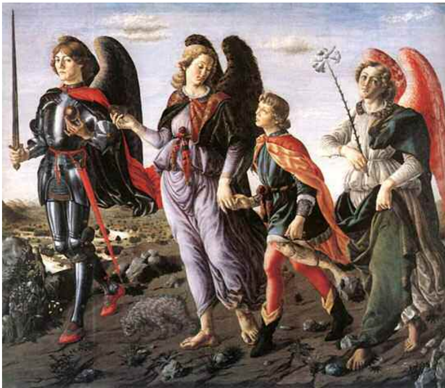
Tempera on wood, c.1467, Francesco Botticini (1446-1497), Uffizi, Florence