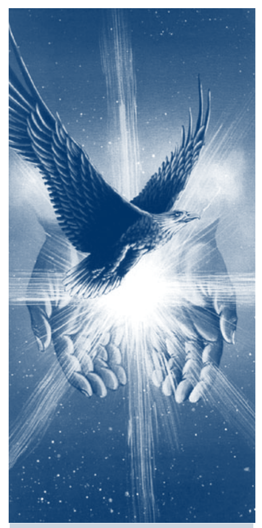
Scorpio: Power of Regeneration

Scorpio is the only sign composed of three sym-