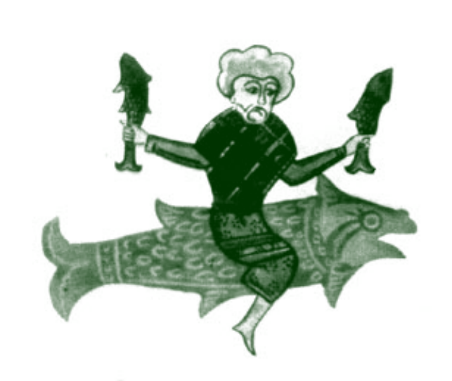
Armenian manuscript, number 3884, 1461 A.D., Madenataran Erevan, Armenia Pisces \\ Mastery\ of\ the\ energies\ of\ this\ mutable\ sign\ is\ indicated\ in\ the\ above\ depiction.

Pisces is the last sign of the zodiac and the inner