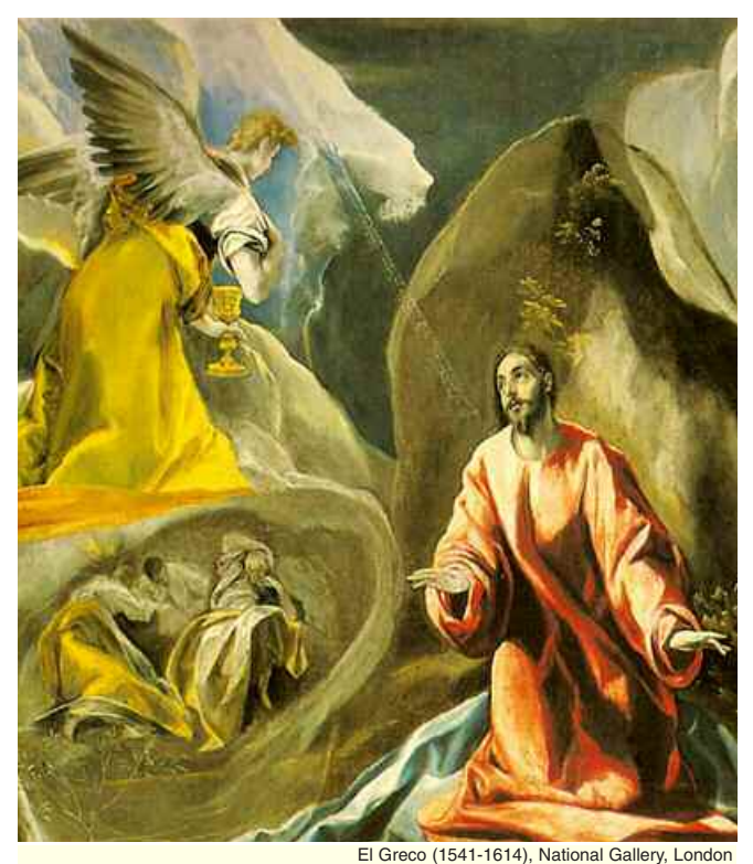
Christ on the Mount of Olives (detail)

The proffered chalice is symbolical of the Redeemer's acceptance of the agony of the cross.