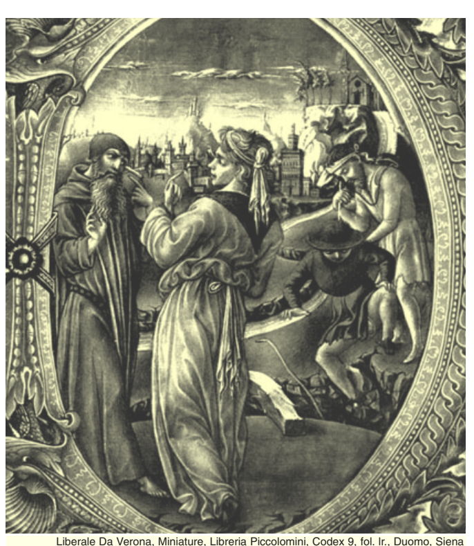
Parable of the Beam and the Mote "Why beholdest thou the mote that is in thy brother's eye, but

A trait much in evidence in our times is a vain and self-degrading insistence on avoiding any pain incident to self-discipline. We impoverish the spirit and impede our evolution by our unwillingness to experience and endure the physical hardship of