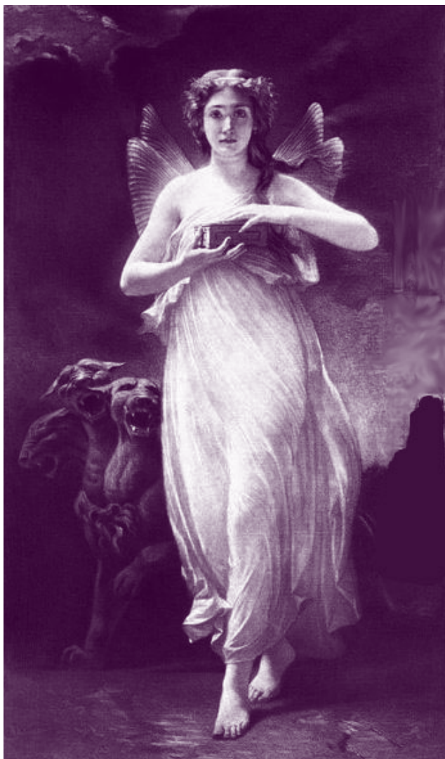
Psyche in the Underworld

Then came the era of the steam engine, the day of machinery when man became only a cog in the production mechanism, when he could scarcely hope to become master but must drudge his life