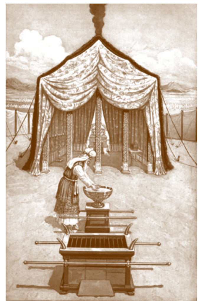
From Manly P. Hall's THE SECRET TEACHINGS OF ALL AGES, © Philosophical Research Society **The Courtyaró of the Tabernacle**

The Court of the Tabernacle was an enclosure