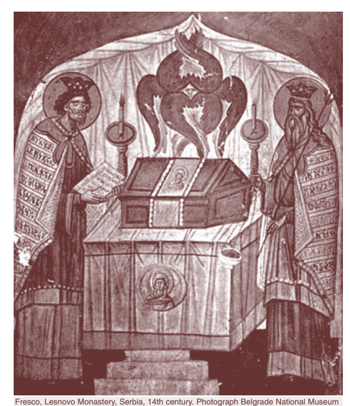
The Ark of the Covenant Two priests flank the Ark, one bearing Aaron's Rod that budded and a censer. A Cherubim hovers above the Ark.

Christ also explained at that time in mystic but unmistakable language what that living bread, or manna, was, namely, the Ego. This explanation will be found in verses 33 and 35 [John 6], where we read: "For the bread of God is he which cometh down from heaven and giveth light unto the