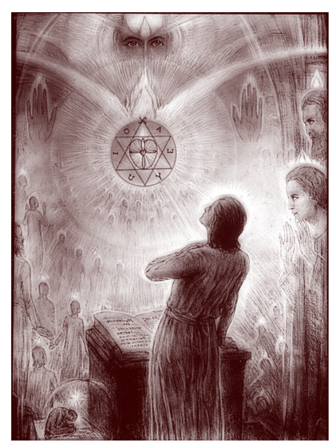
A wisdom revelation before students in an etheric school.

Under such questioning I answer that I least of all have deserved such high grace from God, for I