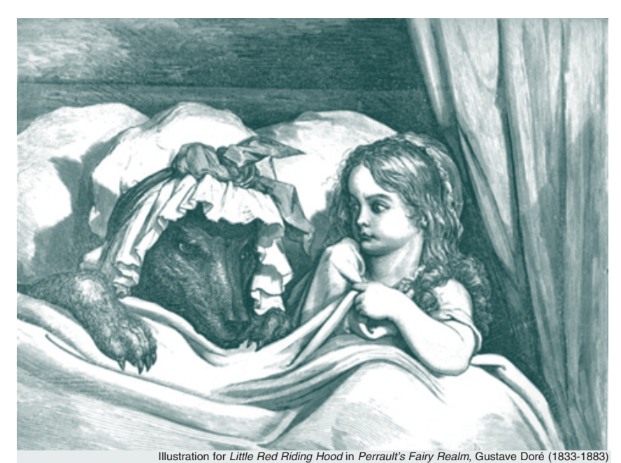
A muted version of the demonic or evil is embodied in the wolf whose wiles (posing as grandmother or sheep or even guardian angel) may deceive the ignorant.

The first hypothesis is that there is a path of initiation into the spiritual mysteries of life which every human may tread, nay, must sooner or later