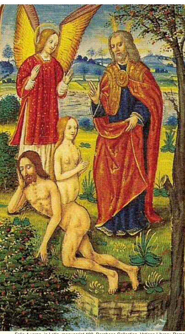
Folio 4 verso, in Latin, manuscript 193, Borghese Collection, Vatican Library, Rome

If it is contended that man received his soul in the