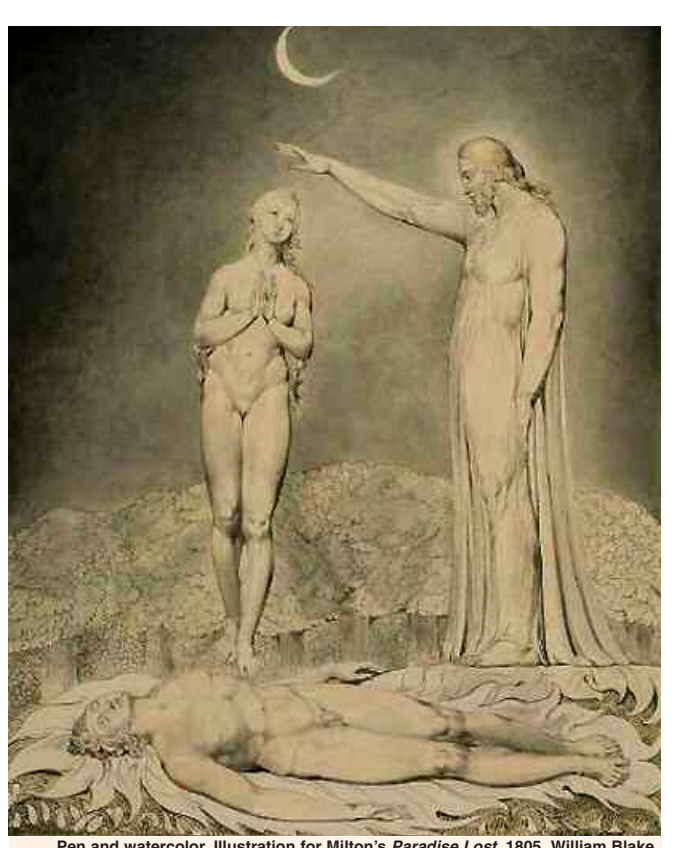
Pen and watercolor, Illustration for Milton's Paradise Lost , 1805, William Blake, Museum of Fine Art, Boston The Creation of Woman

When this alteration is made, the occult teaching as previously given harmonizes with that of the