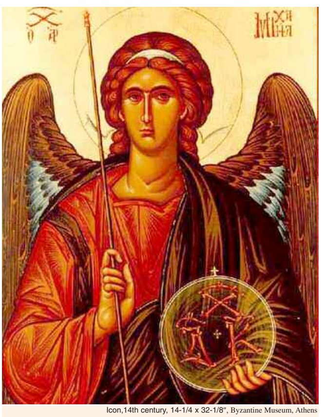
The Archangel Michael

In the tenth and eleventh chapters of Daniel we are given an insight into the workings of the invisible government of the Race Spirits, the powers behind the throne. Daniel is much disturbed in Spirit; he fasts, for fully three weeks, praying for light, and at the end of that time an Archangel, a Race Spirit, appears before him and addresses him: