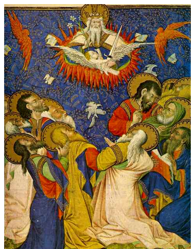
From Les Grandes Heures Du Duc De Rohan, Master of the Rohan Hours (11-3/8 x 8-1/8"), Miniature, Bibliothèque Nationale, Paris