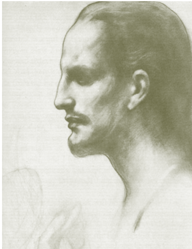
Graphitel, Kahlil Gibran (1883-1931), International House, New York City

Is it important that we know what Christ Jesus looked like? That we have a photographic souvenir of Him? In fact, there may well be occult reasons why none is available. Not only was His spiritual identity an enigma, even to His disciples, His physical person was not apparently outstanding, either in handsomeness, physical impressiveness,