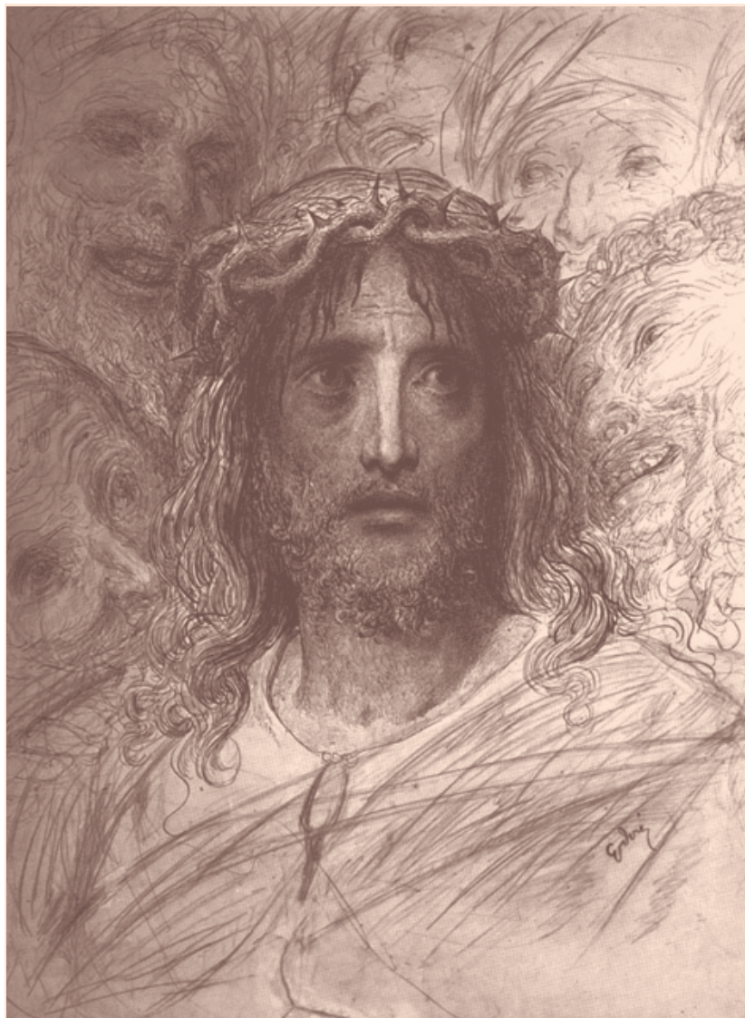
Ink and pencil, 1875, Gustave Doré (1833-1883)

The question “What did Jesus look like?” is a variant of the Messianic question asked by the Jewish people, “How shall we know Him when He comes?” Not by his features but by what he can do and does. For Christians, the ultimate deed is that Christ Jesus rose from the dead. Else is all their faith in vain. The Jewish criterion was that He would free their people, be their leader and ruler in this world. The Jesus they were looking for would wield magisterial authority and possess a comparably imposing physical person. He would cham-