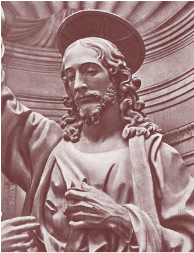
Detail, Andrea del Verrocchio (1432-1488), Orsanmichele, Florence