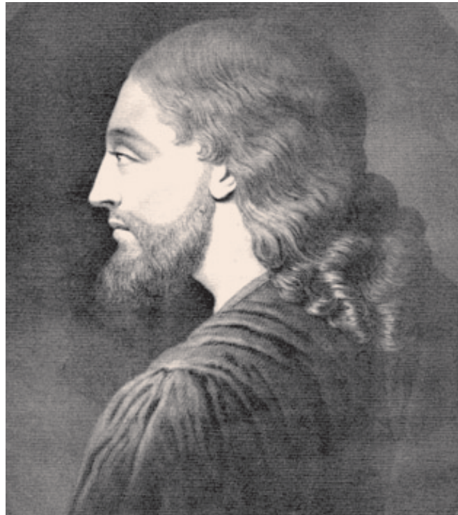
Engraving, John Sartain (1808-1897), Palinsky Gallery, Flint, MI

In another sense, the absence of a confirmed image of Christ Jesus is not extraordinary. The orthodox Hebrew tradition of not making graven