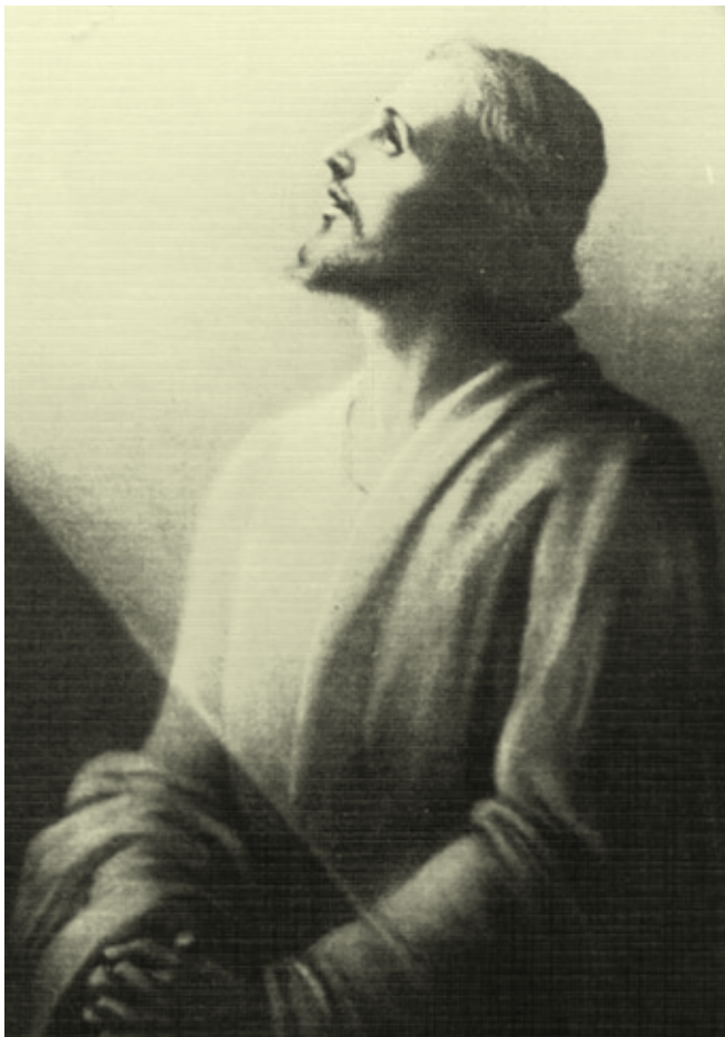
Bertha Valerius, 10 ft. x 6 ft., private chapel, Stockholm