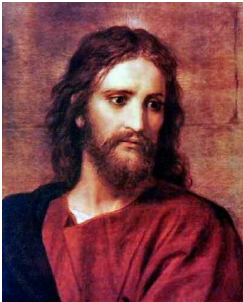
Heinrich Hoffman, 1824-1911

Any artist who has sought to capture the divinity of Christ in the physical body of Jesus has been challenged and inspired to portray certain human qualities in their consummate form, such as humility, love, quiet dignity, virile piety, for which He must serve as the Exemplar. Therefore, to be faith-