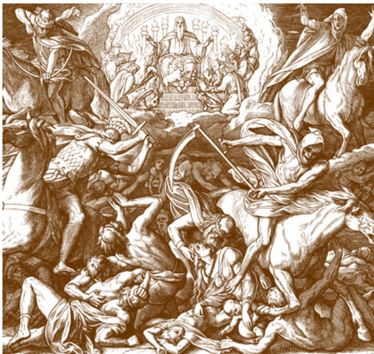
From Die Bibel in Bildern , Julius Schnorr von Carolsfeld (1789-1853)

This story of involution and evolution and the “Days of Creation” can be found in the first and second chapters of Genesis, if read in their true