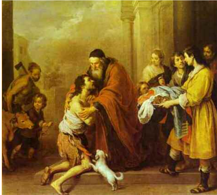
Bartolomé Estéban Murillo (1617-1682), Sutherland Collection, London

Before starting his pilgrimage through matter, the Prodigal Son was a celestial being, pure and innocent, but without knowledge. Prompted by an inner intuition which faintly told him of his inherent but latent possibilities, he aspired to wisdom and experience. This aspiration brought a momentary light, and looking out into the depths of space, he beheld a vision of what he might be. Across a valley of crystallized matter (symbolized by the zodiacal Wheel of Life) enveloped in dense clouds