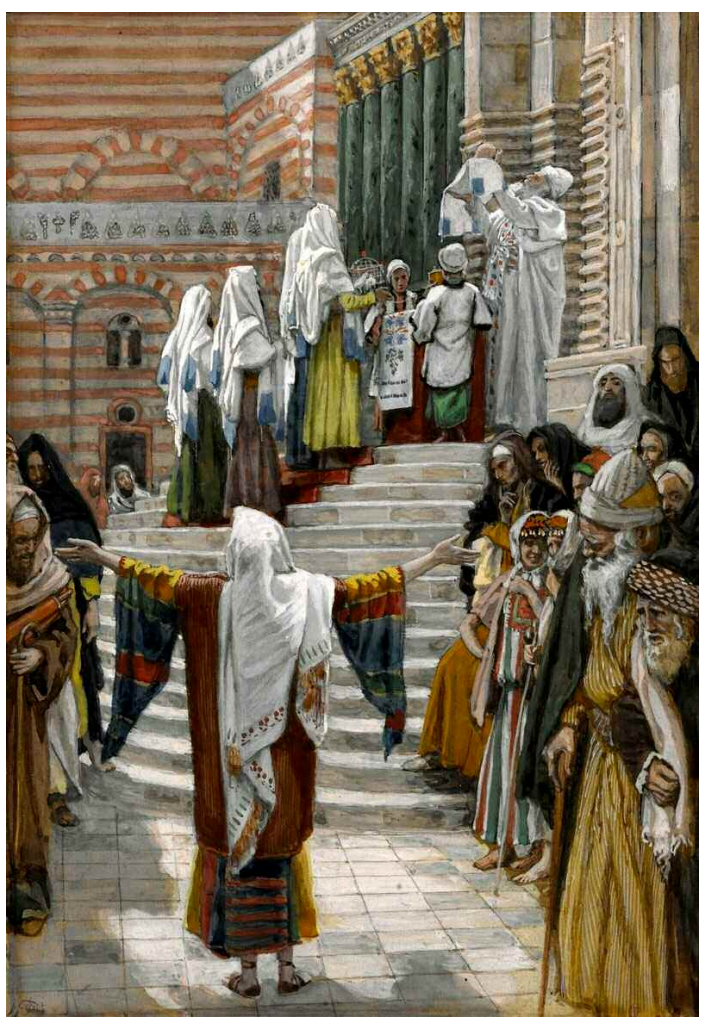
Watercolor, J. James Tissot, Brooklyn Museum

Note the inversion of the genealogy. The line of purity traces back to God, whereas the Matthew genealogy, as the line of experience, is cumulative, descending from Abraham presentward. Note also that the angel appears to Mary in the Luke account, which advances the heart principle and the purity motif. In Matthew, where the experience motif and the worldly mental element are stressed, the angel appears to Joseph (four times—1:20, 2:13, 2:19, 2:22). And because the Matthew Jesus embodies the kingly line of descent, this gospel mentions Herod's fear of a contender to his authority, one who may challenge him: the King of the Jews, "a Governor that shall rule my people Israel." Herod asks the Wise Men to inform him where Jesus was, but they declined and returned to their own country by another route.