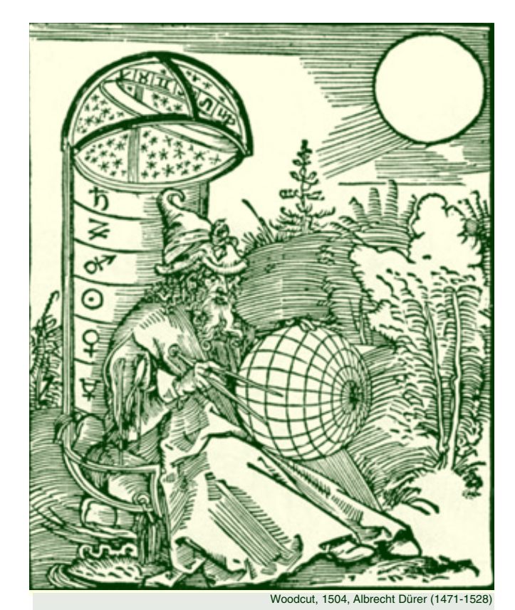
Astronomer This illustration was created when astronomy and astrology were still regarded as two phases of one integrated science.

So, jolted out of my assumption that astrology would provide me with an easy code to laying bare the souls of others, I began a careful scrutiny of every chart that came my way in an effort to mea-