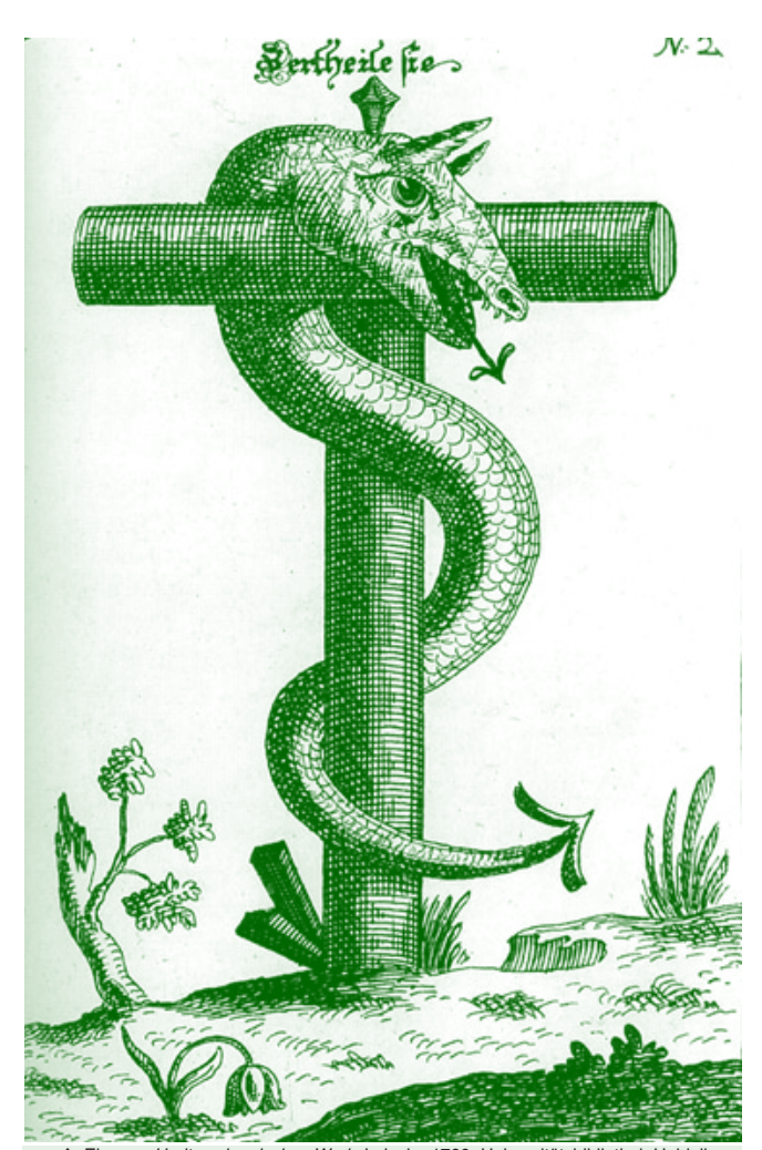
A. Eleazar, Uraltes chymisches Werk, Leipzig, 1760, Universitätsbibliothek Heidelberg Both an alchemical and religious symbol, the serpent nailed to the cross is a generic depiction of the nodal (serpentine) path of all planets, including the sun, as they intersect (cross over) the straight line of the equator. Planetary cycles of time can thus be measured in terms of these "serpentine" nodes.

When the Dragon's Head and Tail transit the degree of the Ascendant and the seventh house of one's nativity, an important period of life will just be entered into. It always marks a period of transition: a new life, new interests, and an altered envi-