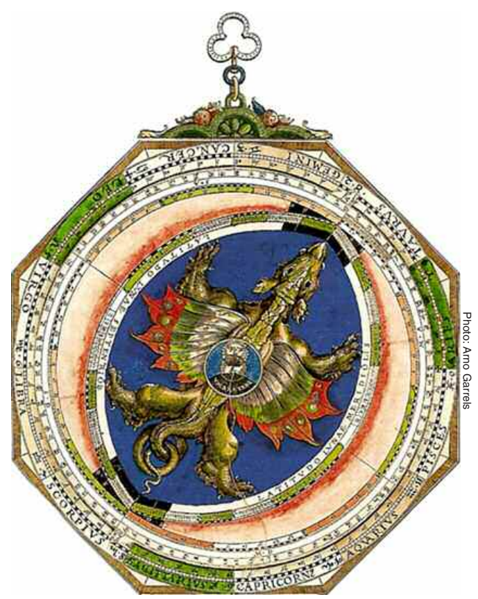
P. Apian, Astronomicum Caesareum, Ingolstadt, 1540, Stadtbibliothek Mainz

The position of the Dragon's Head and Tail (or the Moon's North and South Nodes, as they are usually called), is of particular significance in