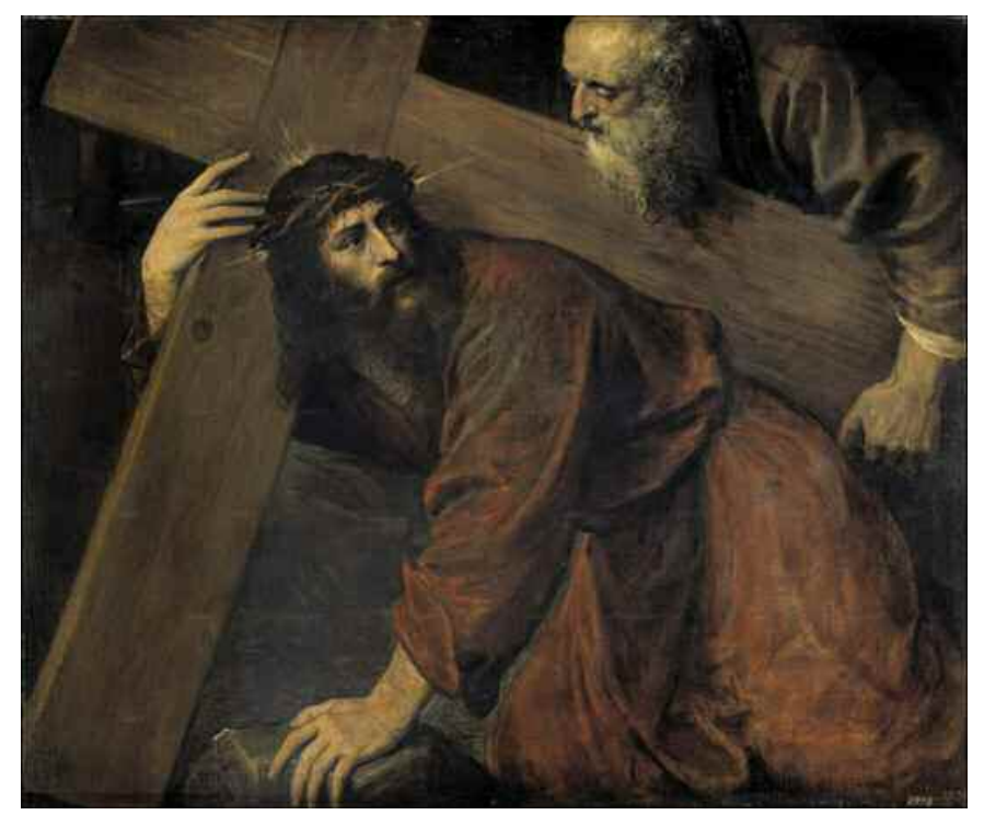
Oil on Canvas,1565. Titian (Vecellio di Gregorio Tiziano). Prado Museum, Madrid, Spain Christ and the Cyrenian