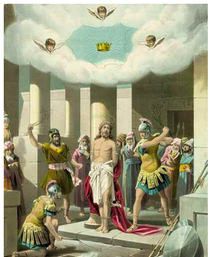
Lithograph by Lehman & Bolton, 1888 The\ Scourging

"The ability to be centered in oneself—to stand, out of the power of one's own inner being, in spite of all assaults from without—this is the power that is developed through scourging."