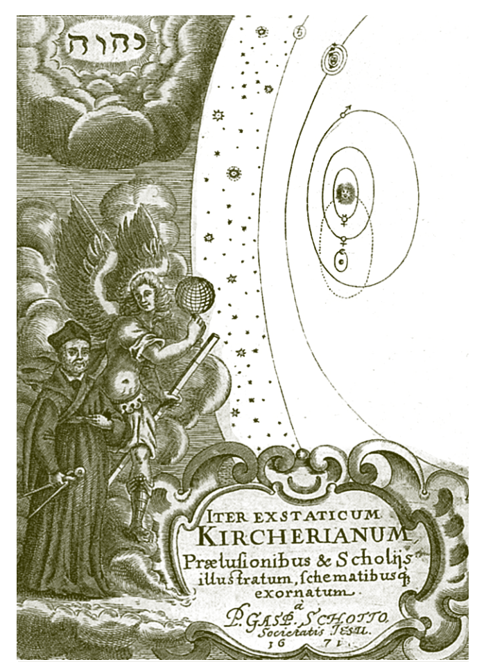
A. Kircher, Iter extaticum (Ed. Caspar Schott), Wurzburg, 1671, Stadtbibliothek Mainz

Thus we may say that aspects indicate the degree of prominence or influence a planet has due to its integration and relationship with other plan-