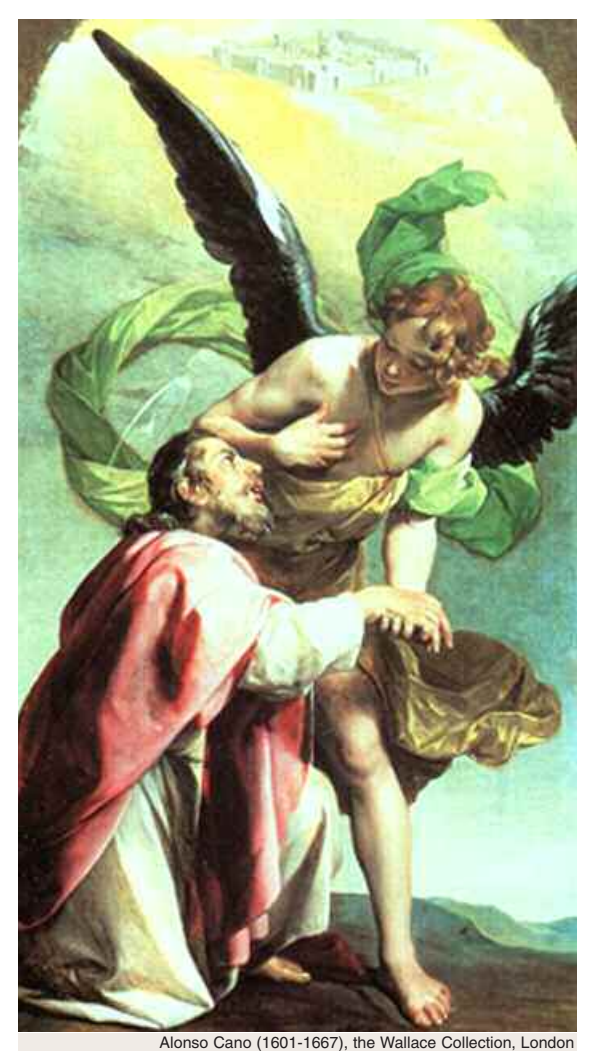
The Vision of St. John the Evangelist The four-square New Jerusalem with twelve gates, symbolizing the regenerate mind, is shown above.

there will be but one Universal Brotherhood, under the leadership of the Returned Christ. Love will be unselfish and reason will approve its dictates. Each will work for the good of all, because self-seeking will be a thing of the past. Universal Brotherhood will bind all beings of the Earth together in Love. There can be no death, for the tree of life, the faculty of generating vital force, is made possible by means of the ethereal organ in the head already mentioned, which will be evolved in