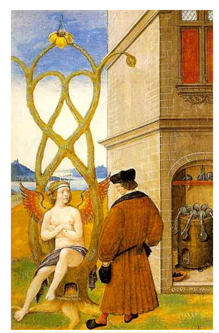
Miniature, Jehan Perréal, 1516, court of Margaretha of Austria, Musée Marmottan, Paris Nature advises the "aimlessly wandering alchemist" to leave the narrow circle of mechanical laboratory chemistry ("opus mechanice"): "You will never attain knowledge of anything if you come not to my forge." This forge is the tree of knowledge that grows from the three roots Mineralia, Vegetative, and Sensitiva (dense physical, vital, and desire bodies). The four (etheric) elements are refined to a "vegetable gold." Alchemy (the path of Initiation) follows the work of nature, but seeks to shorten the ripening process. The angel of the Work, whose lowest body is etheric, wears a crown raying the seven cosmic energies, signified by the seven planetary symbols. Note the lemniscate (figure eight symbol for eternity) and the similarity of the tree's structure to the design on the covers of Rosicrucian Fellowship books.

There are many who, realizing the possibility of producing this spiritual gold, set out enthusiastically to accomplish the Great Work, overnight as it were. They eagerly attend every meeting they can, read occult books, wade through courses in philosophy. Yet when it comes to their being asked to throw in all of their life resources into the crucible which produces and accomplishes the Great Work, by giving up many of their habits, pleasures, pur-