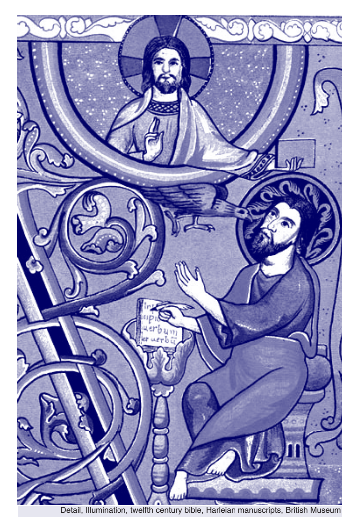
The life-tableau of Christ Jesus was given to humanity—first to the Apostles and Evangelists, the "eye-witnesses and ministers of the word," and the Initiates. Since then it has been the common karmic property of mankind; it is the unwritten "fifth Gospel" which may be read in the aura of the Earth.

But Christ Jesus at His death renounced the vision of the tableau; He gave it up to humanity, and it became the content of what the disciples later "remembered" in the light of the Pentecost-flame. It was also that which the Evangelists contemplated from different points of view, the vision from which they wrote their records. The normal life-tableau is given over to the Gods, the Angels,