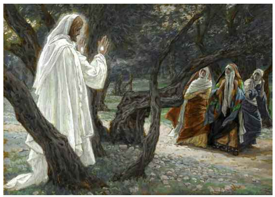
J .James Tissot, Brooklyn Museum of Art

The Risen One was a Being who united in Himself experience of the Heavens, of life and suf-