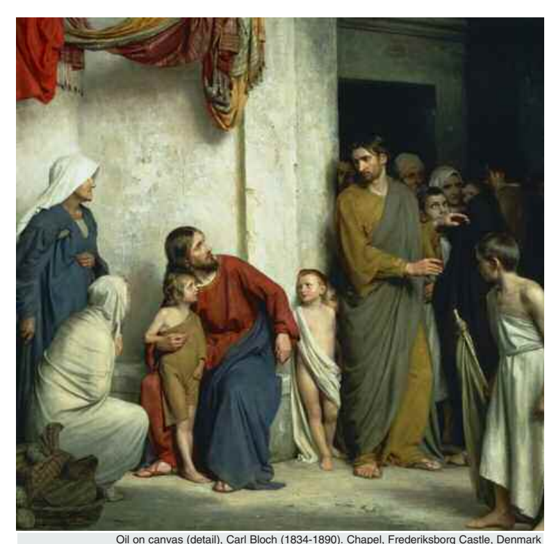
Let the Little Children Come to Me "If any man desire to be first, the same shall be last of all, and servant of all." So do little children teach us, serve us, even as we serve them.

When, in our daily work, we perform to the best of our abilities and with joy, if we do not shy away