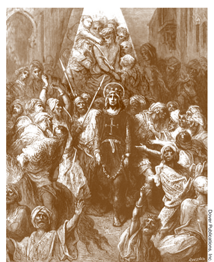
Engraving, Gustave Doré, Illustrations of the Crusades

But when we consider the case of the Christians, the matter is very different. It is true that the Christian religion also teaches that what a man