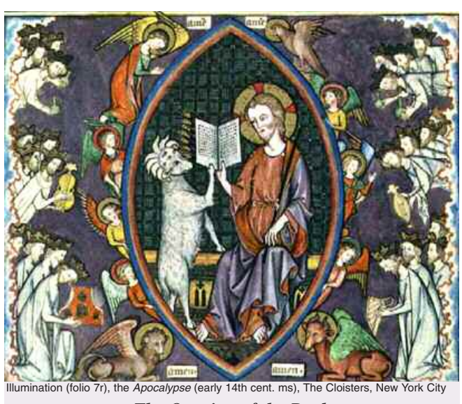
The Opening of the Book Christ as the Lamb opening the Book of Life, or the future's memory, viewed from the realm of Life Spirit, where archetypes in the World of Thought are foreseen and transformed through the expiatory act of the Lamb slain from the foundation of the world.

The test of the Seventh post-Atlantean cultureepoch will consist in overcoming the temptation to rest content with riches derived from the past. For if this sense of contentment is not overcome, a